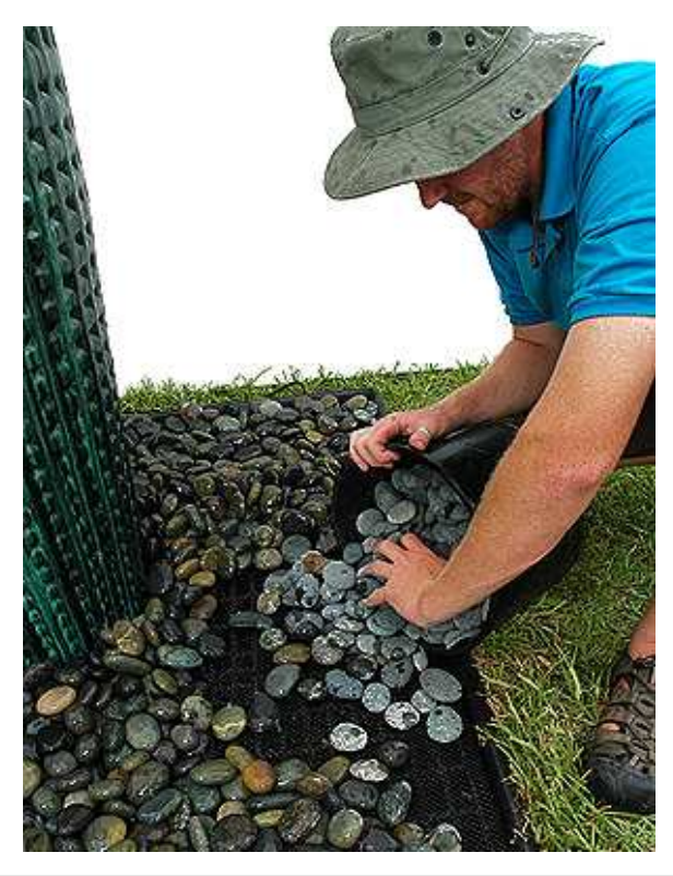
Reservoirs & Installation

12. Put the decorative topping (see next page for choices) around the piece on top of the grating and mesh.