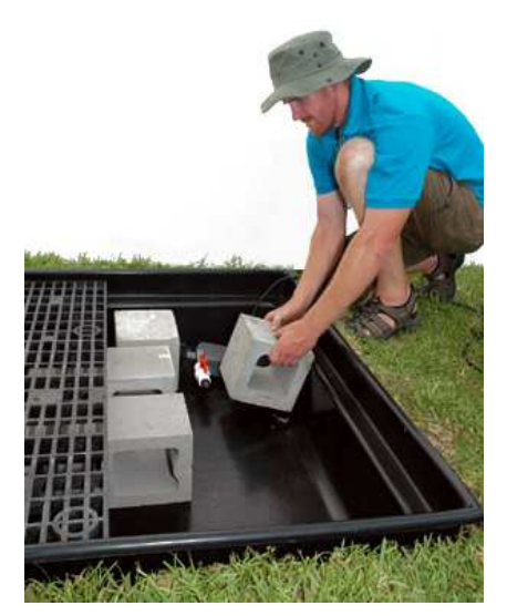
7. Connect the tubing to the piece (leave a fairly long piece of tubing exiting the fountain.)

5. Place 2-3 cinder blocks (depending on the piece) in the middle. For light pieces place the grating on top of the cinder blocks. Heavy pieces require several cinder blocks and must sit directly on the blocks with the grate cut away to go around the piece.