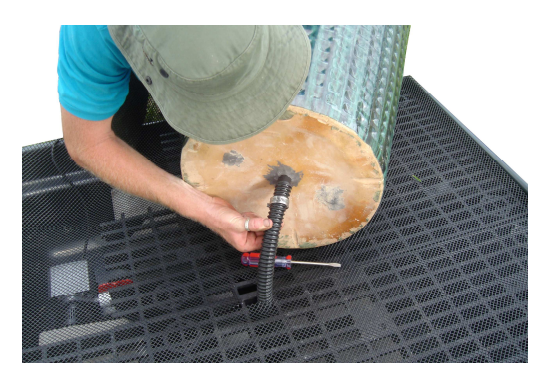
9. Connect the tubing to the pump and clamp.